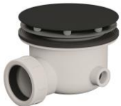
V100281 Syphon-waste 90 mm. ceramic plated