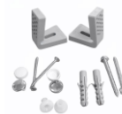
F954199 Fixation set for floor standing wc and pedestal