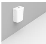
D523001 Close coupled cistern, bottom inlet. To be completed with mechanism and already included fixation