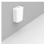
D522901 Close coupled cistern, side inlet. To be completed with mechanism and already included fixation set.